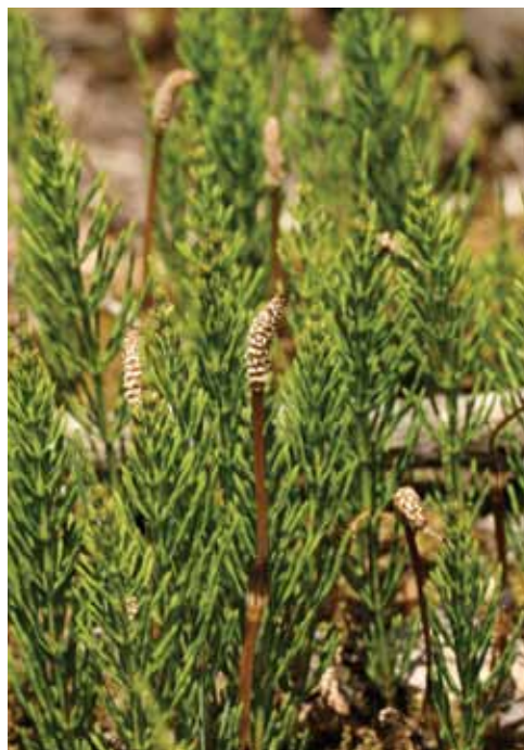
Common horsetail ▶ ( Equisetum arvense )

Rattlesnake fern, which usually grows singly rather than in clumps, gets its name from its fertile leaves, which look like the snakes’ tails. Ebony spleenwort is one of the ferns that remains green year-round; you can see it through winter, provided the snow isn’t too deep. A personal favorite, though, is the maidenhair fern with its finely textured, somewhat frilly fronds and curved, fingerlike stalks. Unfortunately, this fern has become rare in DuPage County.