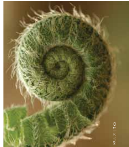
▲ Maidenhair fern ( Adiantum pedatum )