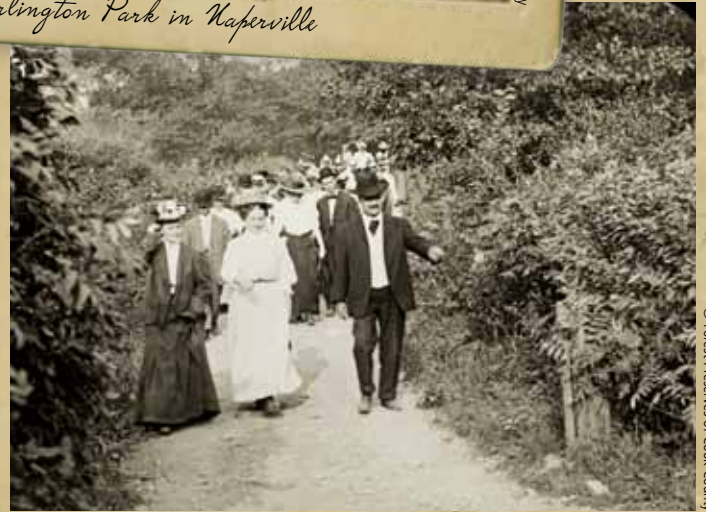
Picnickers at Burlington Park in Naperville