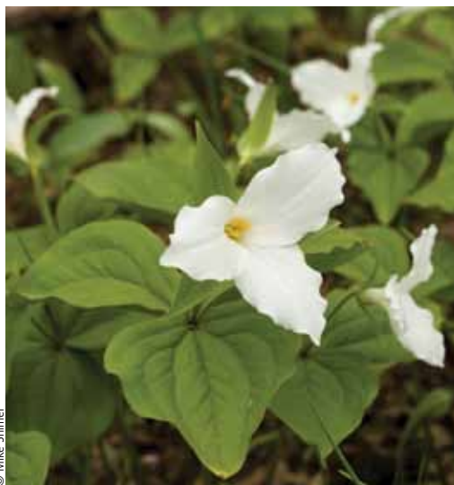
▲ White trillium ( Trillium grandiflorum )