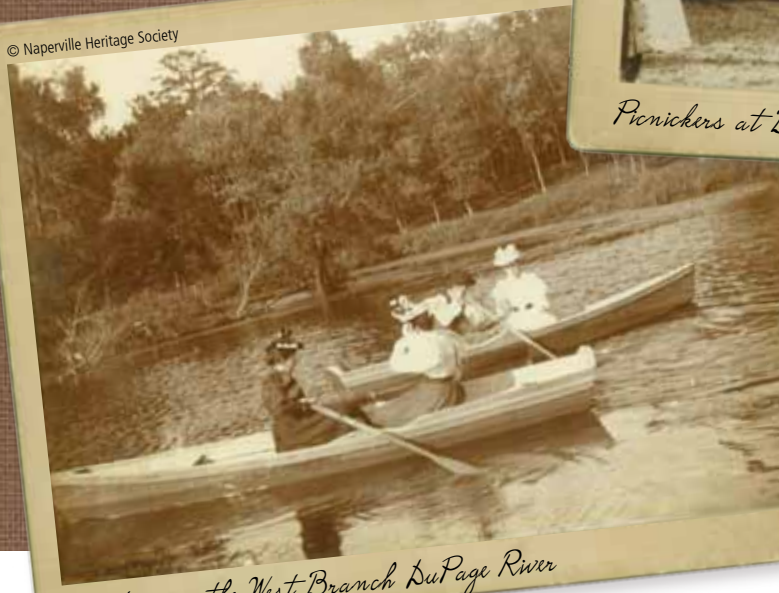
Boaters on the West Branch DuPage River