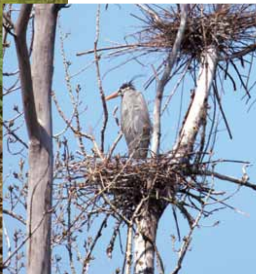
▲ Great blue heron ( Ardea herodias ) in a rookery