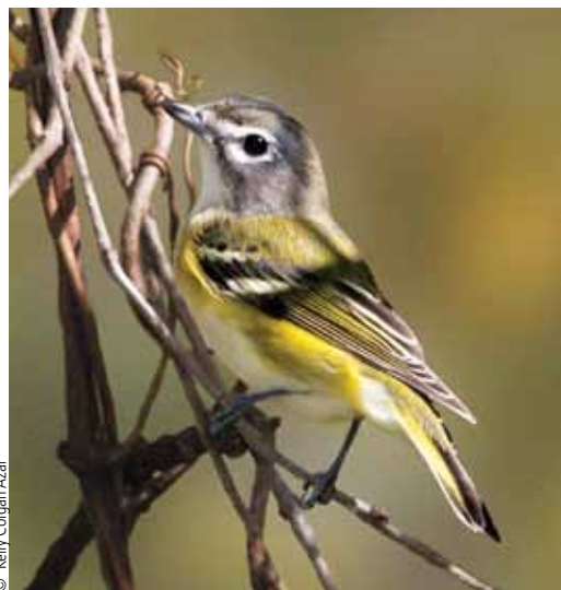
▲ Blue-headed vireo ( Vireo solitarius )