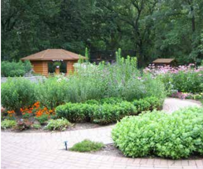
▲ The butterfly garden at Willowbrook Wildlife Center offers ideas to help you be monarch-friendly at home.