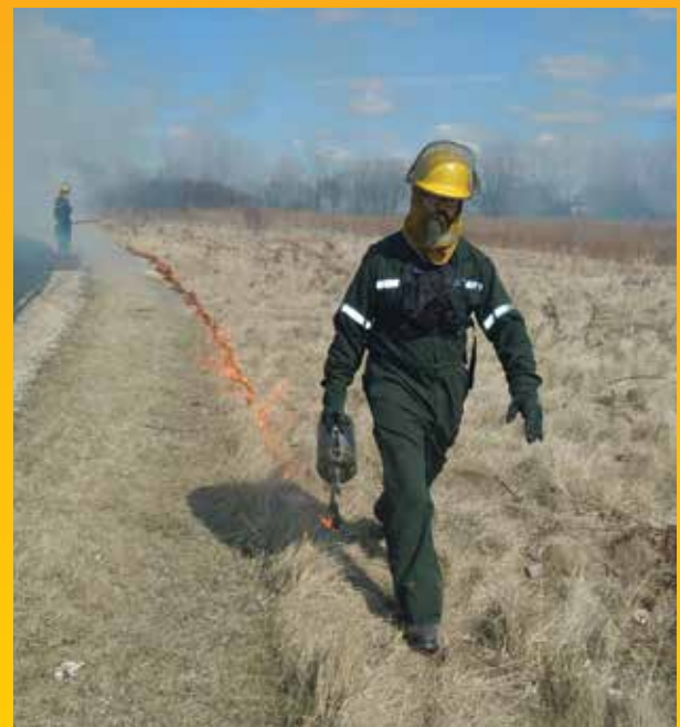
▲ Torch Operator

Puts fires out along the edge of the burn unit