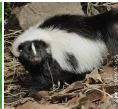
▲ Striped skunk