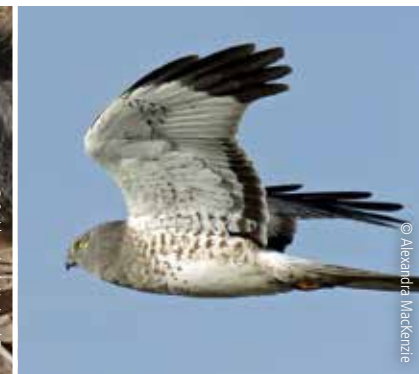
▲ Northern harrier