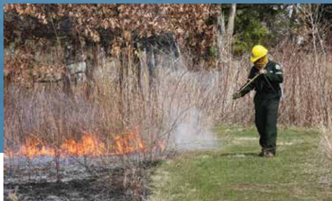
▲ Line Tender

But when fast-growing plants from other regions (European buckthorn or Asian honeysuckle, for example) arrive and quickly spread, the sunlight, water and space they steal from native species causes that diversity to dwindle. Fortunately, unlike natives, which developed side by side with sporadic fires over millennia and have deep roots and thick bark to withstand the