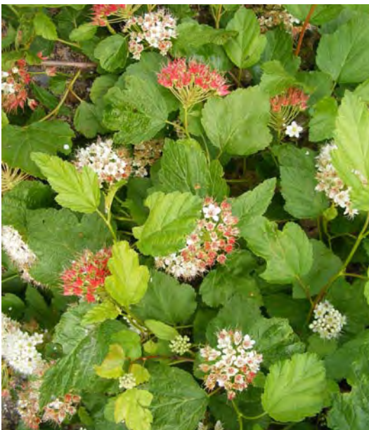
Physocarpus opulifolius Common Name: Ninebark Mature Height: 8-10'

Large, spreading evergreen shrub. Excellent cover for small animals.