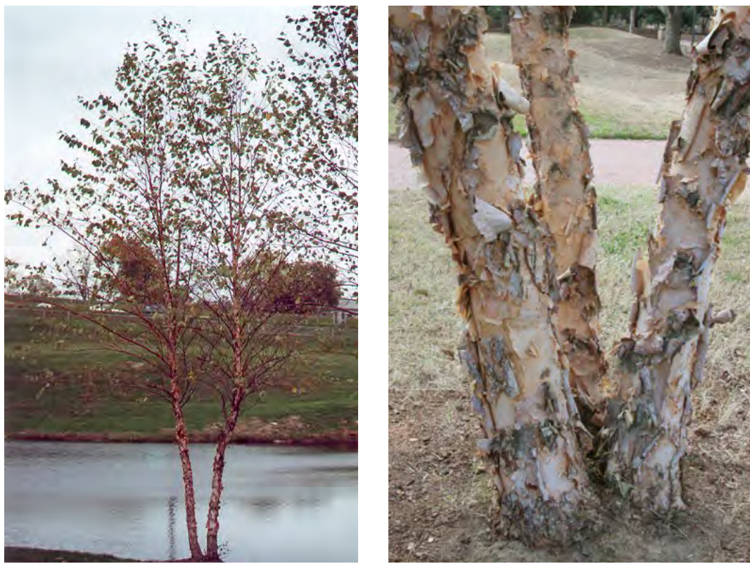
Betula nigra Common Name: River Birch Mature Height: 40-70' Fall Color: Yellow

River Birch is a moderately fast growing tree with light brown exfoliating bark. It is native to stream banks and floodplains.