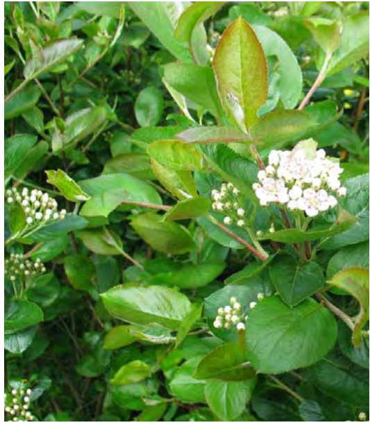
Aronia melanocarpa Common Name: Black Chokeberry Mature Height: 3-5'

Choke Cherry is a small tree or a large, suckering shrub. White flowers bloom in late April or May, which give rise to edible fruit for wildlife.