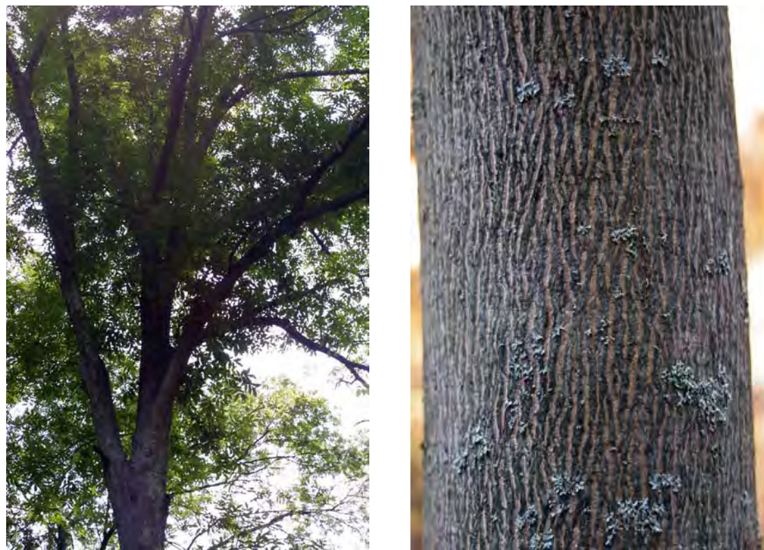
Carya cordiformis Common Name: Bitternut Hickory Mature Height: 50-75' Fall Color: Yellow

River Birch is a moderately fast growing tree with light brown exfoliating bark. It is native to stream banks and floodplains.