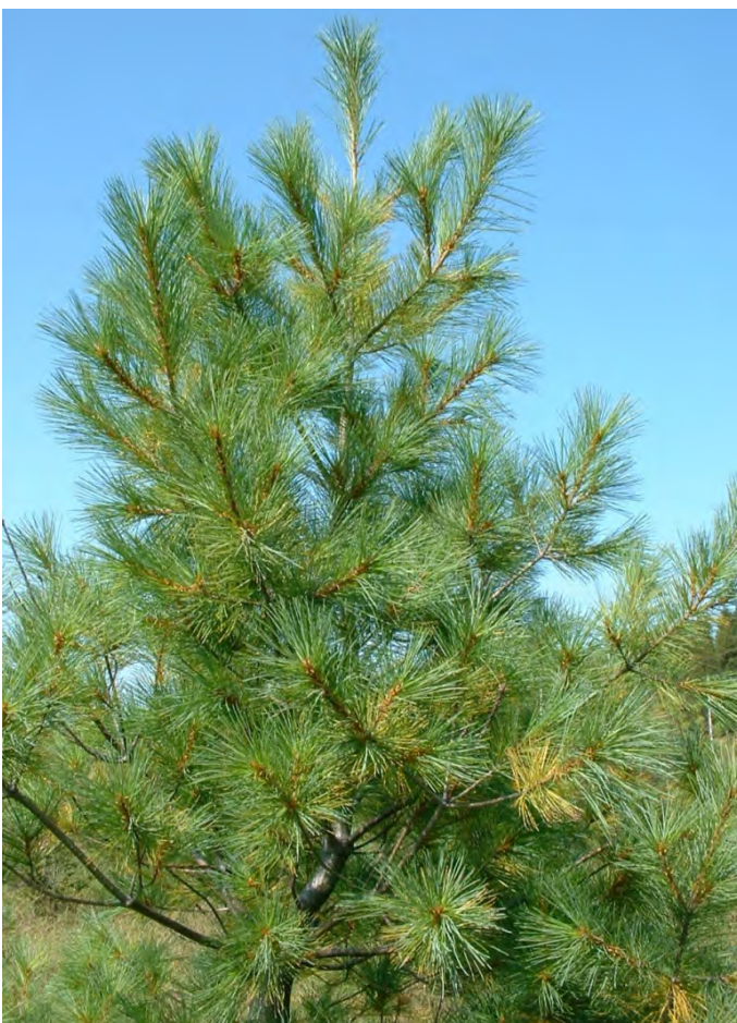
Pinus strobus Common Name: White Pine Mature Height: 50-80'

White Spruce is an adaptable evergreen native to northern forests, including Wisconsin and Michigan.