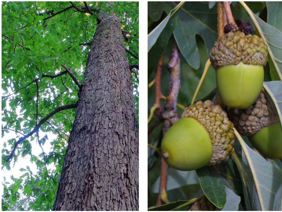
Quercus alba Common Name: White Oak Mature Height: 50-80' Fall Color: Brown to Red

Broad shaped native shrub with white flowers in June-July.