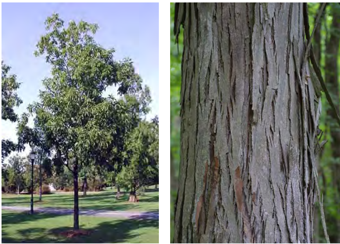
Carya ovata Common Name: Shagbark Hickory Mature Height: 60-80' Fall Color: Yellow-Brown

Bitternut hickory is the fastest growing of the hickories and features an interesting snakelike bark on young stems. It is native to area woodlands.