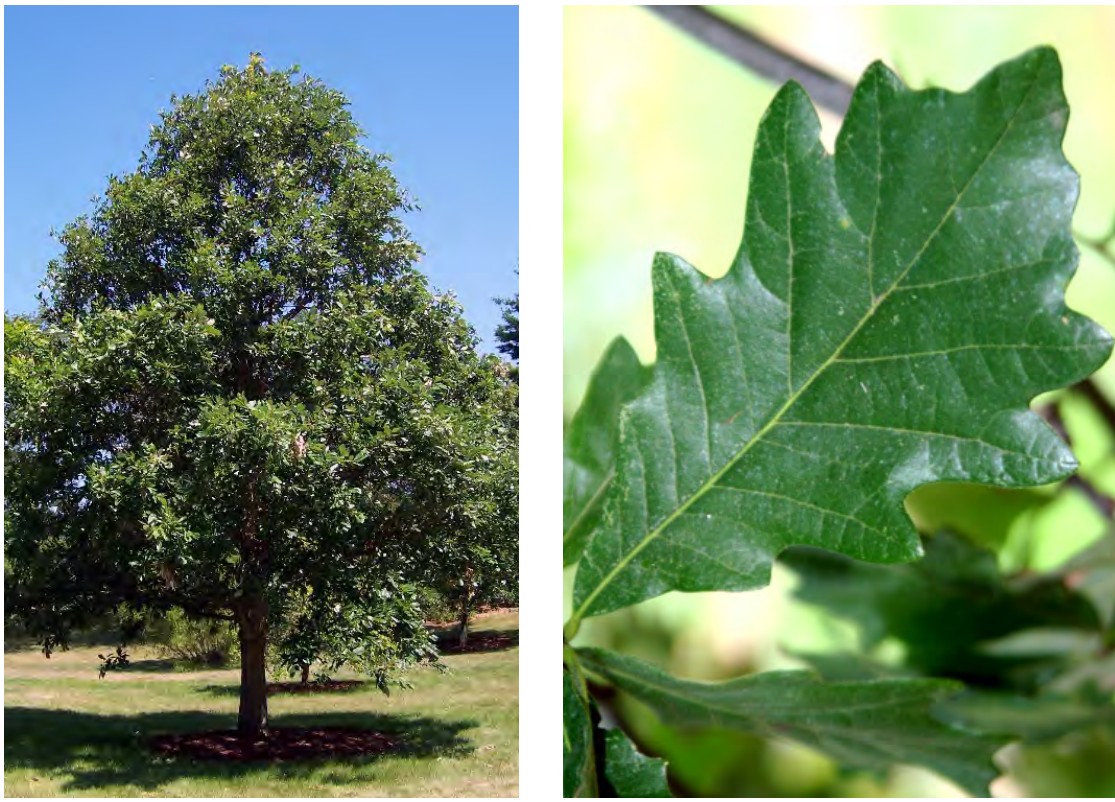
Quercus bicolor Common Name: Swamp White Oak Mature Height: 50-60' Fall Color: Yellow to brown

White Oak is the state tree of Illinois. It is a majestic tree in maturity, native to upland woodlands and savannas.