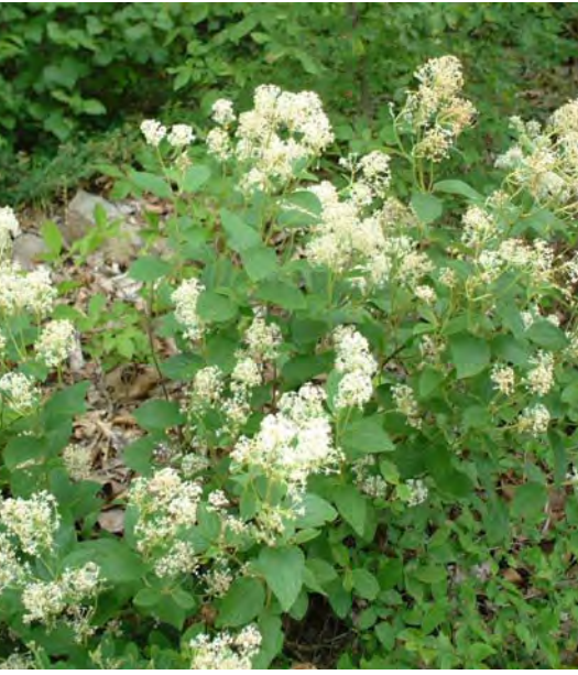
Ceanothus americanus Common Name: New Jersey Tea Mature Height: 2'

Black chokeberry is a medium sized native shrub with white flowers in spring, red fall color and attractive berries in late fall.