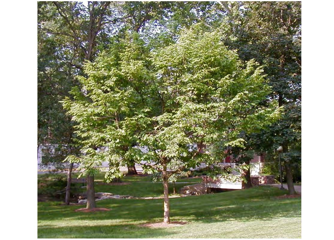
Ostrya virginiana Common Name: Ironwood Mature Height: 25-40' Fall Color: Yellow

Prairie crab is a native variety of crabapple with showy white or pink blossoms.