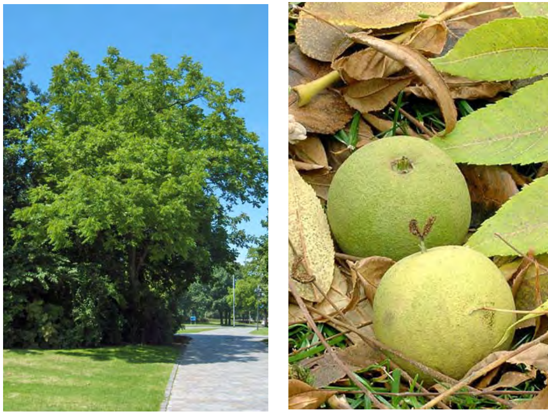
Juglans nigra Common Name: Black Walnut Mature Height: 50-75' Fall Color: Yellow

White Pine is native to sandy soils along lake Michigan and northern forests. It has a soft texture and feel with a pleasant pine scent.