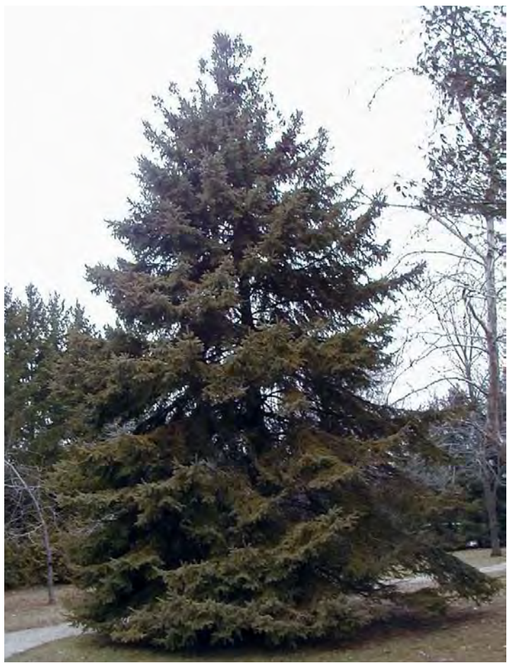
Picea glauca Common Name: White Spruce Mature Height: 40-60'

Redbud is known for its reddish-purple blossoms in March and April. It is native to area woodlands.