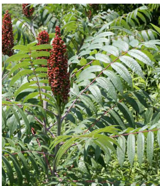
Rhus glabra Common Name: Smooth Sumac Mature Height: 10'

Large native shrub with exfoliating bark and pink flowers in June.