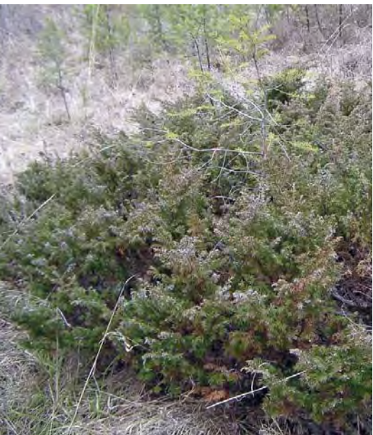
Juniperus communis Common Name: Common Juniper Mature Height: 5-10'

Low, mounding native shrub with yellow flowers in June and yellow, orange and red fall color.