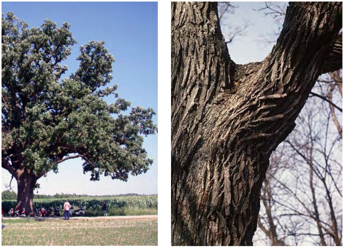
Quercus macrocarpa Common Name: Bur Oak Mature Height: 70-80' Fall Color: Yellow-brown

Swamp White Oak is a coarse textured oak with large leaves that is native to low lying areas including floodplains and stream banks.