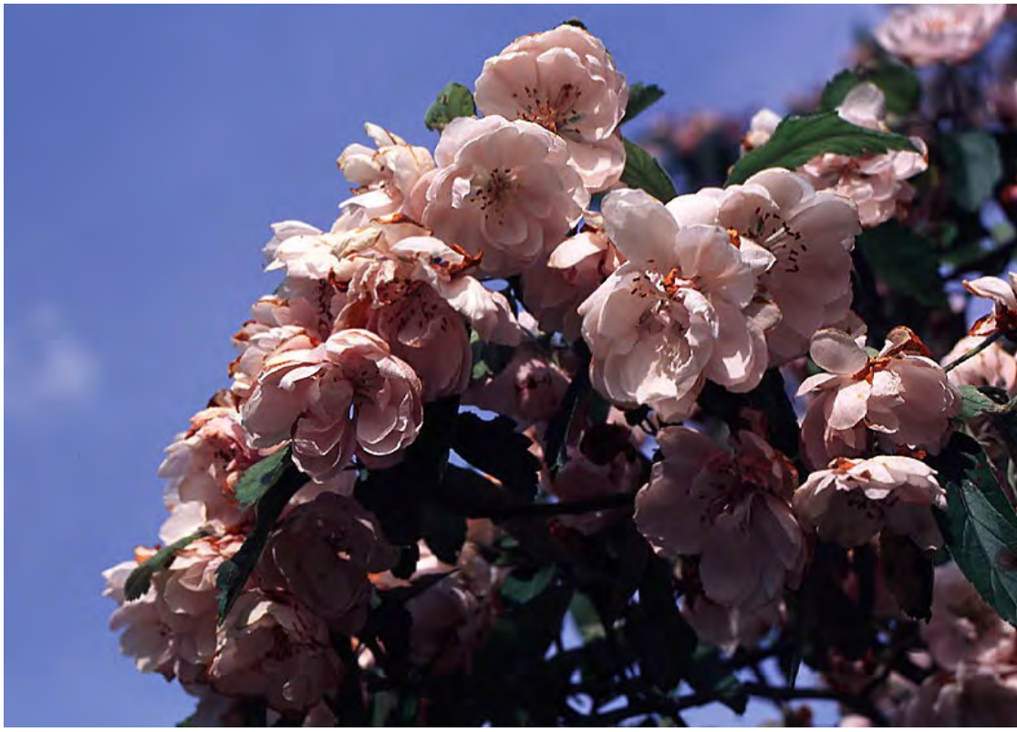
Malus ioensis Common Name: Prairie Crab Mature Height: 20-30' Fall Color: Yellow-green

Black walnut is a large tree native to upland woodlands and savannas. It provides edible fruit for wildlife.