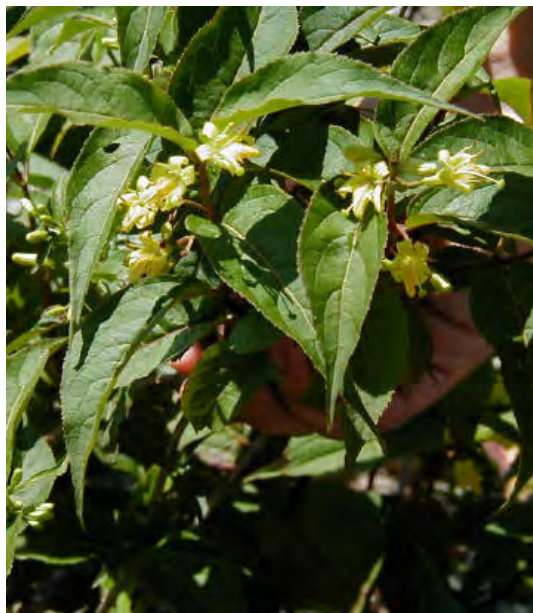
Diervilla lonicera Common Name: Dwarf Honeysuckle Mature Height: 2-3'

One of the hallmark trees of upland savannas, Bur Oak grows to be a majestic tree with a broad crown and deeply furrowed bark.