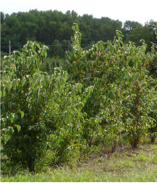
Cornus obliqua Common Name: Silky Dogwood Mature Height: 8-12'

Small native prairie shrub with white flowers in July.