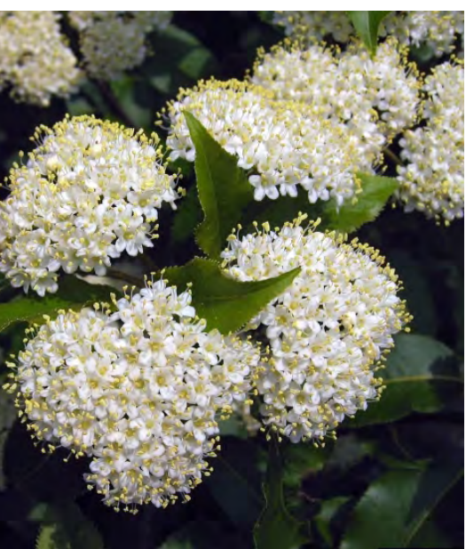
Viburnum lentago Common Name: Nannyberry Viburnum Mature Height: 12-15'

Native shrub with suckering habit and excellent red fall color.