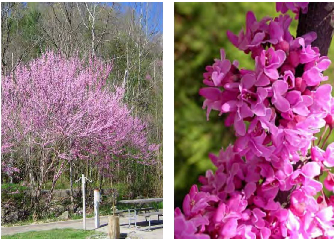
Cercis canadensis Common Name: Eastern Redbud Mature Height: 20-30' Fall Color: Yellow-green

Shagbark Hickory is a characteristic tree of upland woods and savannas along with Oak species. It is known for splitting bark in maturity, which makes the trees look "shaggy."