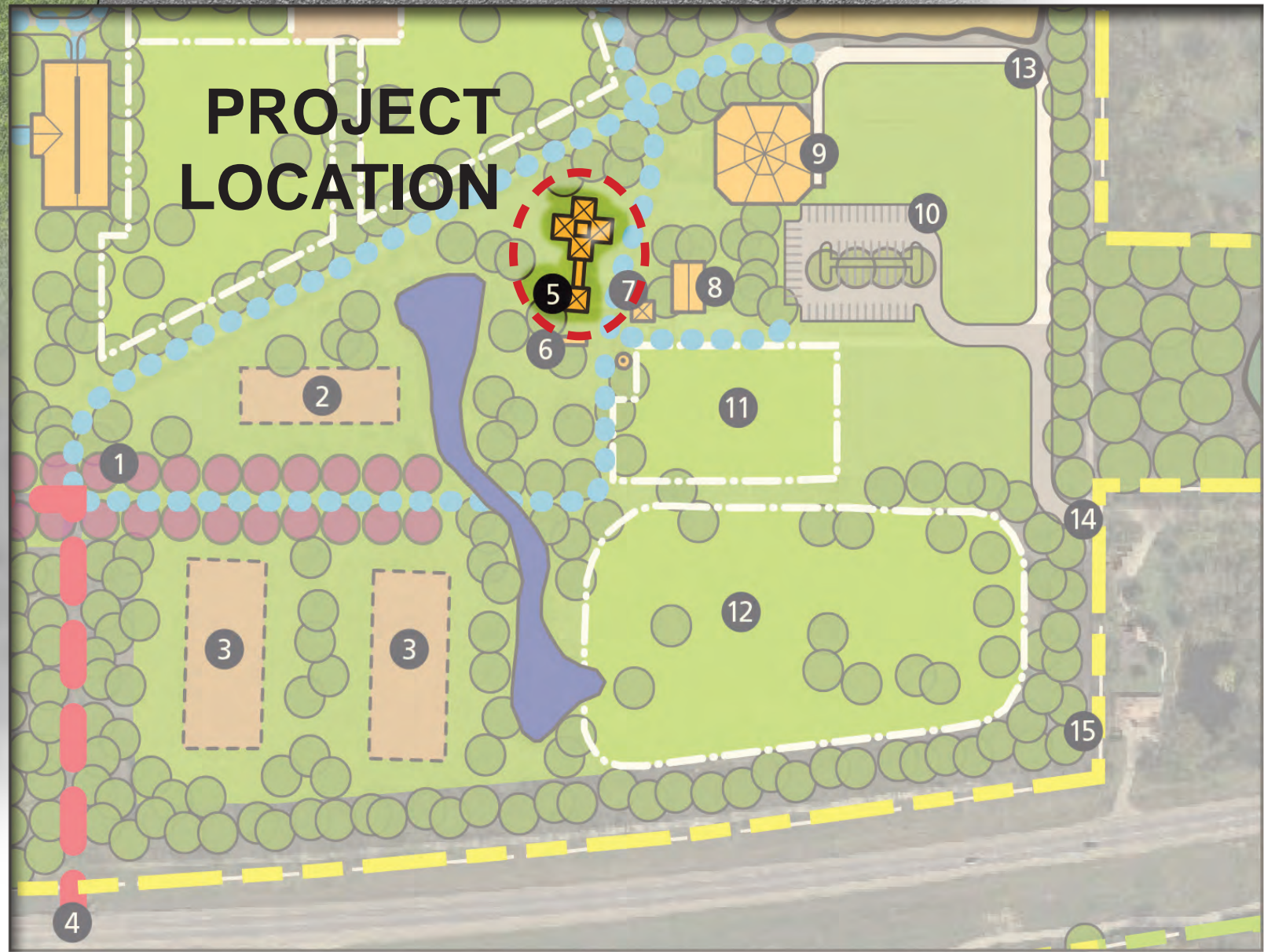
East Farm Enlarged Plan