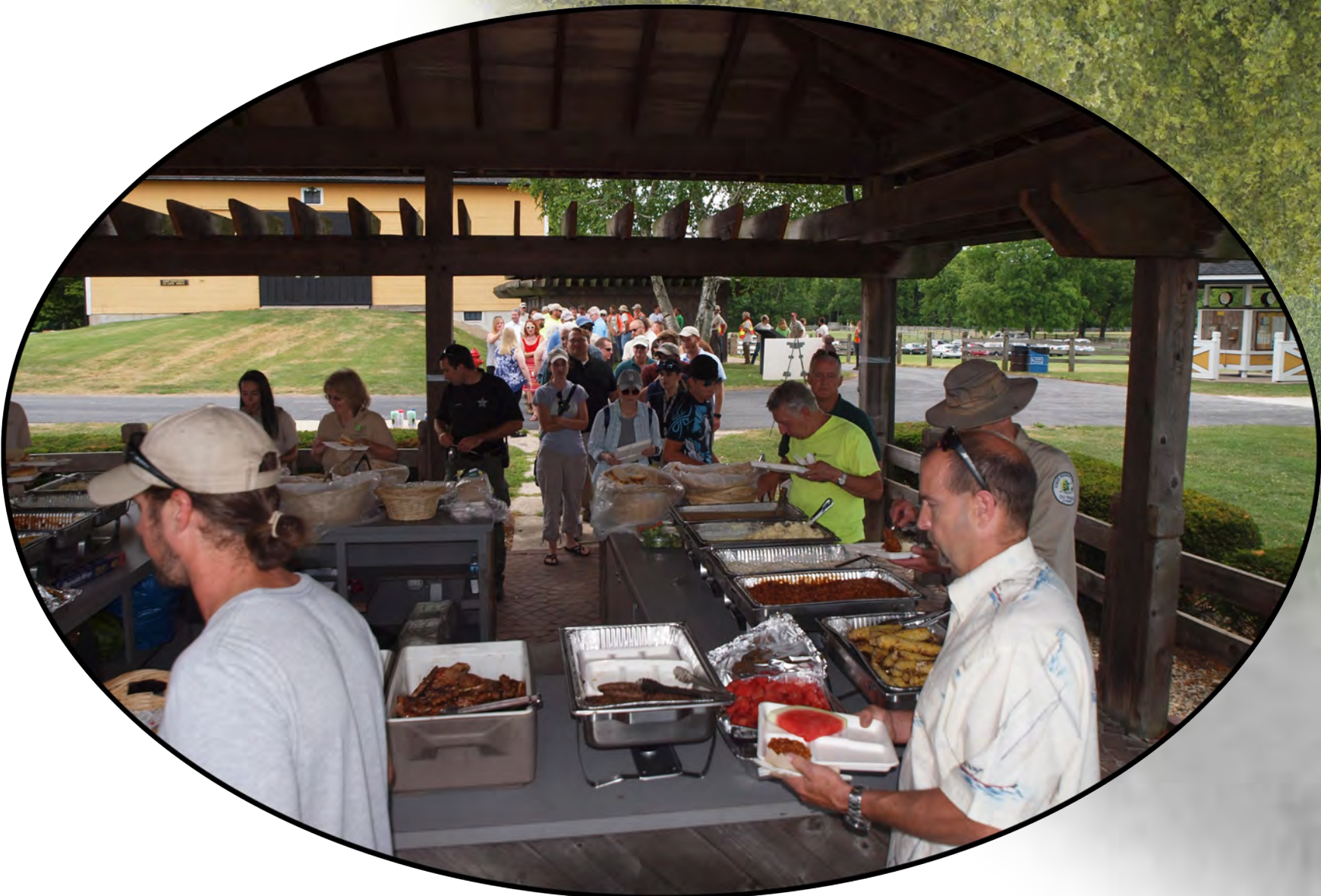
FOOD SERVICE UPGRADES - COUNTER UPGRADES - INFORMATIONAL SIGNAGE - TRASH ENCLOSURE AND SCREENING