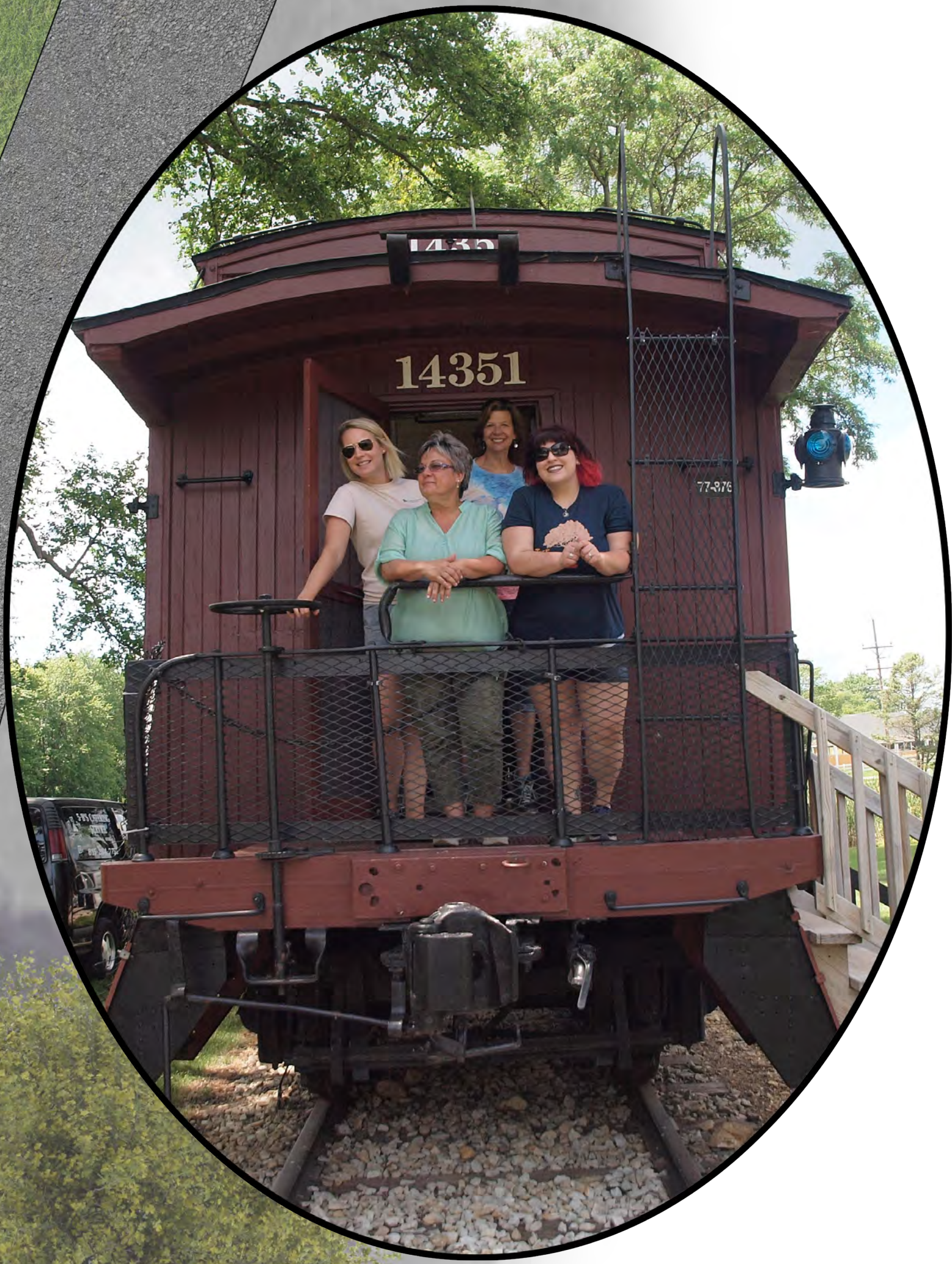
ACCESSIBLE WALKWAYS & UPGRADES TO ACCESS HISTORIC TRAIN CAR