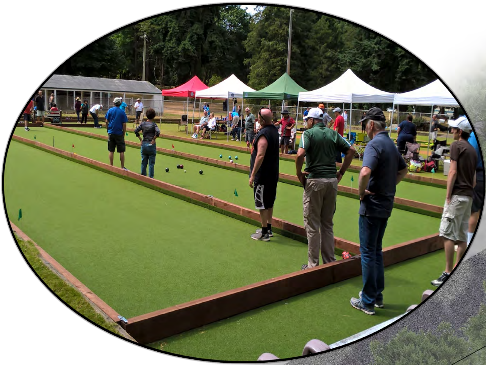
CONCRETE GAME AREA - BOCCE COURT - BENCHES - ACCESSIBLE CONCRETE PAD - RETAINING WALL