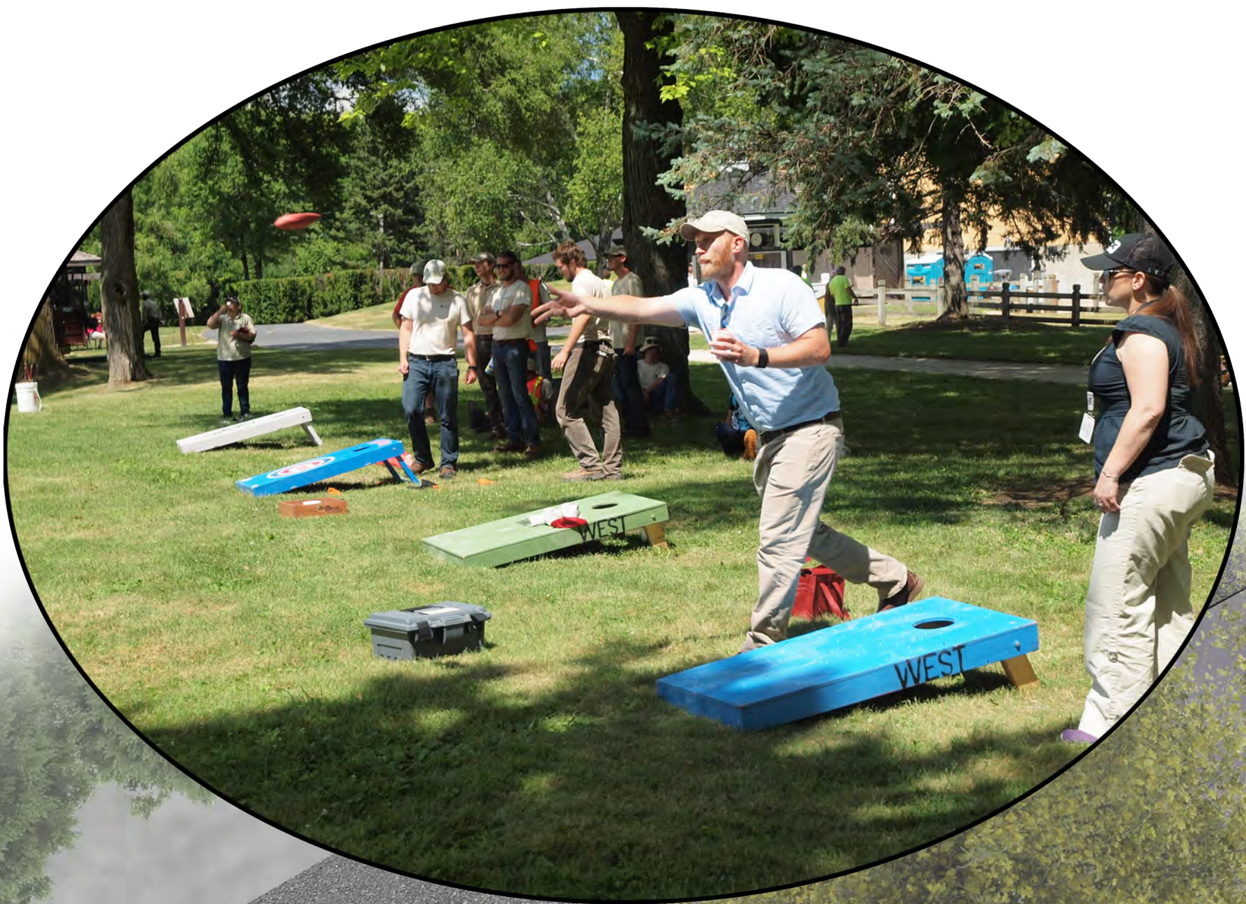
CONCRETE GAME AREA - HORSESHOE/BAGS - BENCHES - ACCESSIBLE CONCRETE PAD