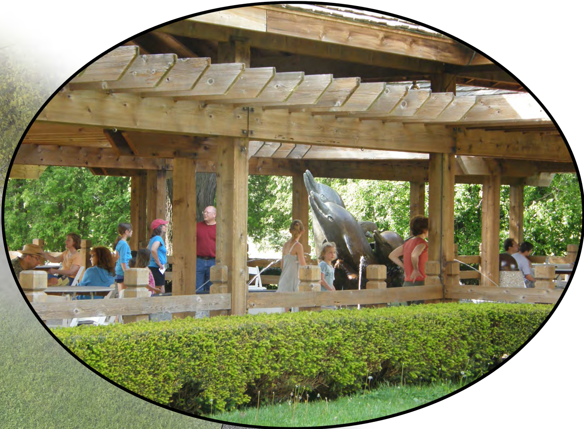
PAVILION STRUCTURE - ROOF REPLACEMENT - STRUCTURAL REPAIR - ACCESSIBLE FLOORING UPGRADES - COVERED BREEZEWAY - NEW BARRIER RAILINGS