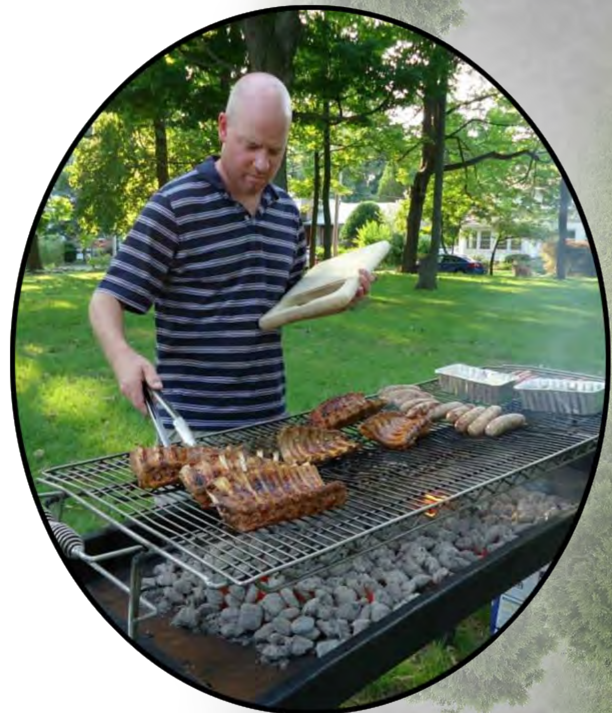
OUTDOOR GRILLS - 2 FIXED GRILLS (1 ACCESSIBLE) - HOT COAL BIN