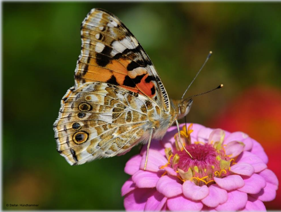
Painted Lady – Vanessa cardui