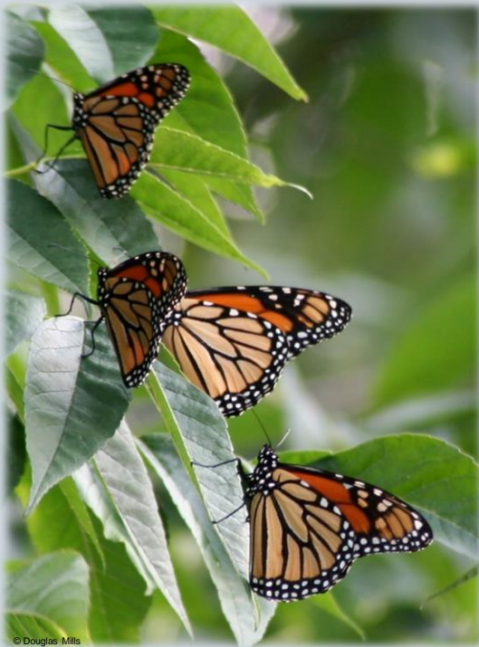
Monarch butterfly – Danaus plexippus