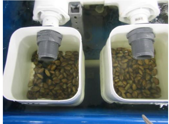
Sub-adult plain pocketbook, Lampsilis cardium , in growout system.