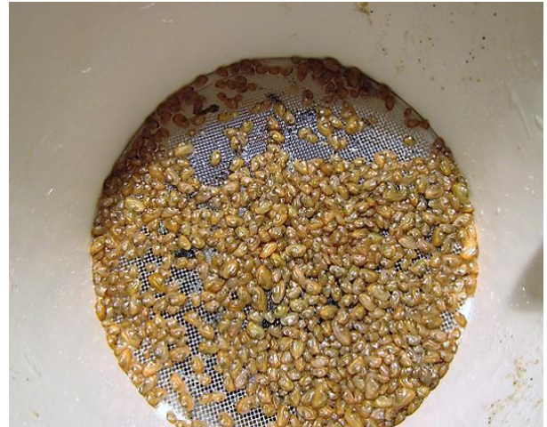
Juvenile plain pocketbook, Lampsilis cardium , in a bucket system chamber.