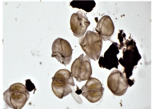
Juvenile white heelsplitter, Lasmigona complanata , raised in Hruska Boxes.