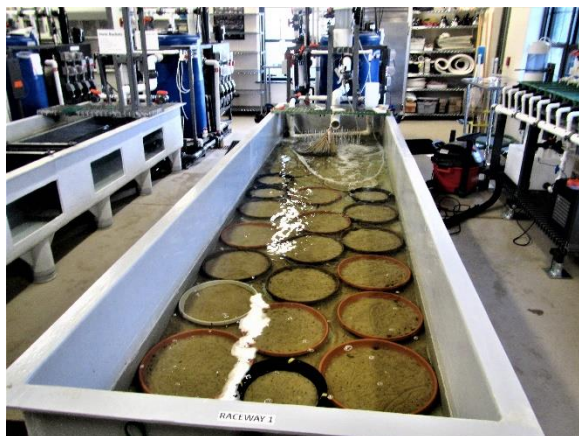
Sub-adult mussel holding raceway