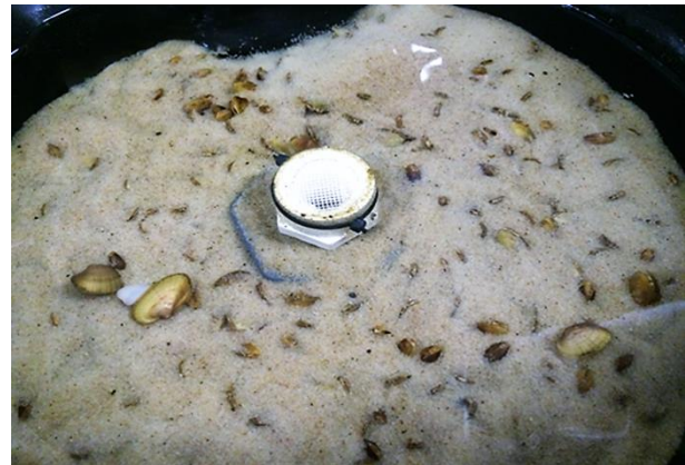
Sub-adult plain pocketbook, Lampsilis cardium , in pan.