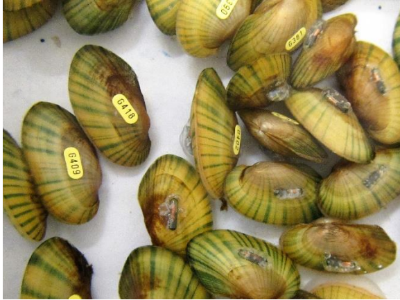
Sub-adult fat mucket, Lampsilis siliquoidea , with Hallprint and PIT tags.