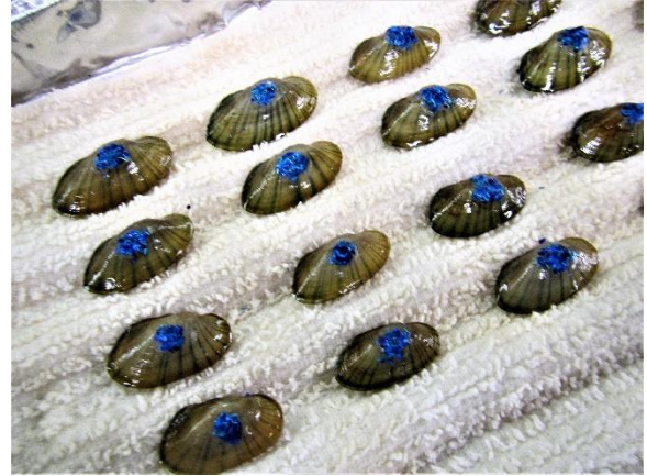
Sub-adult fat mucket, Lampsilis siliquoidea , tagged with glitter.