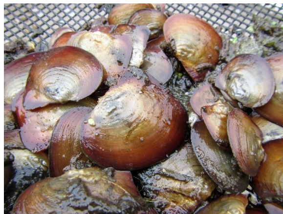
Sub-adult white heelsplitter, Lasmigona complanata , from creekside system.