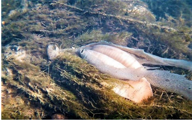
Gravid female plain pocketbook, Lampsilis cardium , displaying lure.