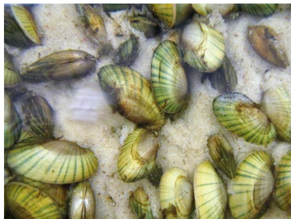
Sub-adult fat mucket, Lampsilis siliquioidea , in raceway.