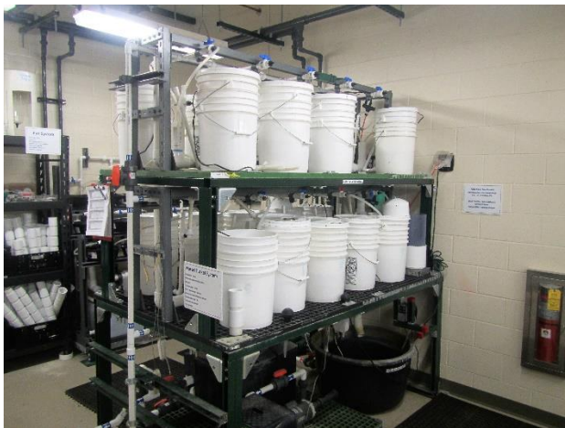
Mussel Bucket System