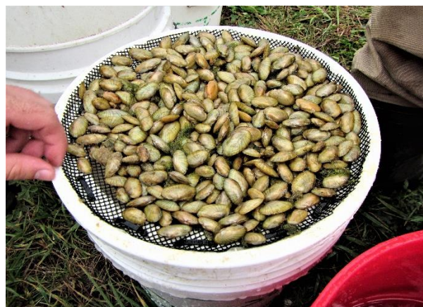
Sub-adult fat mucket, Lampsilis siliquioidea , from floating basket.